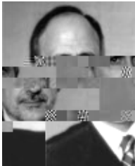
C a C F a C